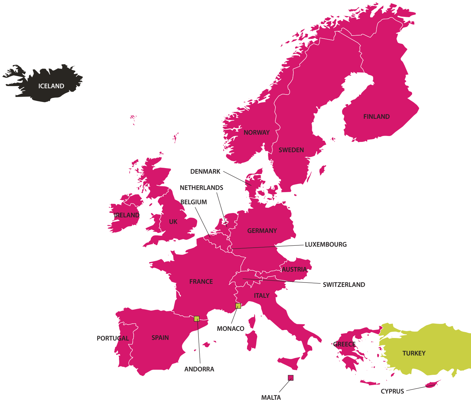
Map 2.3.1: Availability of needle and syringe exchange programmes (NSPs) and opioid substitution therapy (OST)